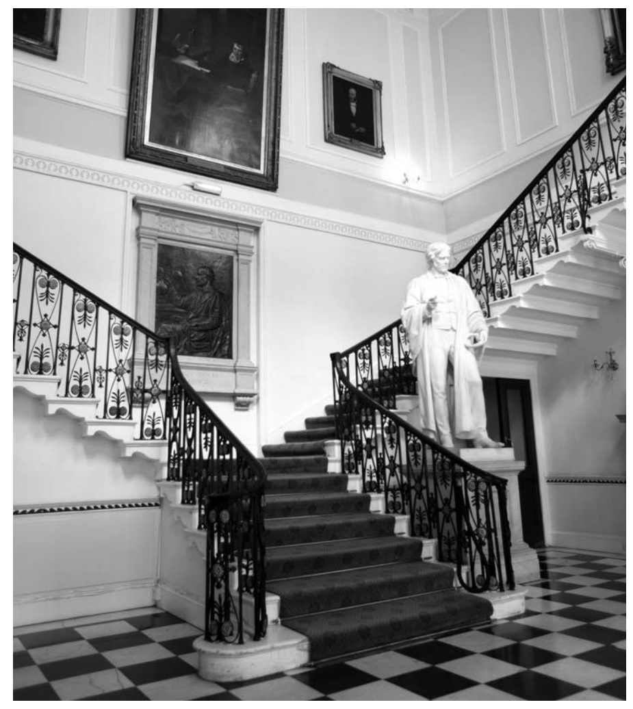
The grand staircase