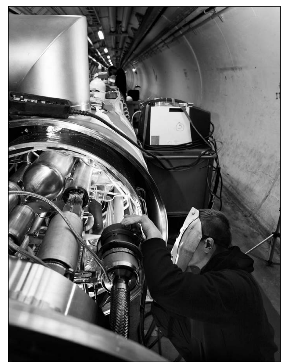
A welder closing one of the interconnects between LHC magnets

Finding the Higgs particle would bring to a close an important chapter in our understanding of nature. Over the last four decades, physicists have pieced together a comprehensive understanding of the fundamental particles of matter and the forces that act between them. The Higgs particle is the last piece in the jigsaw of this so-called standard model, but as with all good stories, the conclusion of one chapter leads naturally into the next.