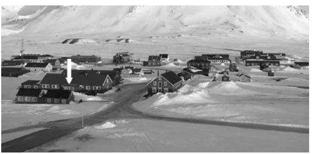
Harland Huset, the NERC base in Ny Alesund, Svalbard

It is very satisfactory that today, despite its lack of Arctic territory, Britain continues to cherish its Arctic activities. The Natural Environment Research Council (NERC) continues to maintain a base in Ny Alesund in northwestern Svalbard, and it is good that this has been named 'Harland Huset'. The Scott Polar Research Institute in Cambridge University continues to lead work on polar processes and climate, and CASP (formerly the Cambridge Arctic Shelf Programme) linked to the Department of Earth Sciences, Cambridge, continues to play a major role in researching the deep structural history of the Arctic Ocean area.