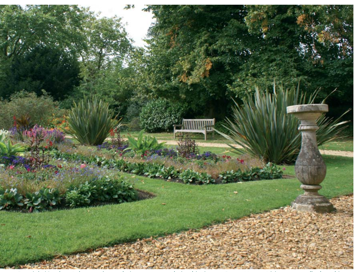
ens – Darwin's 'Outdoor Laboratory' – to their appearance during his time at Down House. Visitors can walk along his

A superb exhibition with many of the original letters and specimens runs at the Natural History Museum in South Kensington until April.