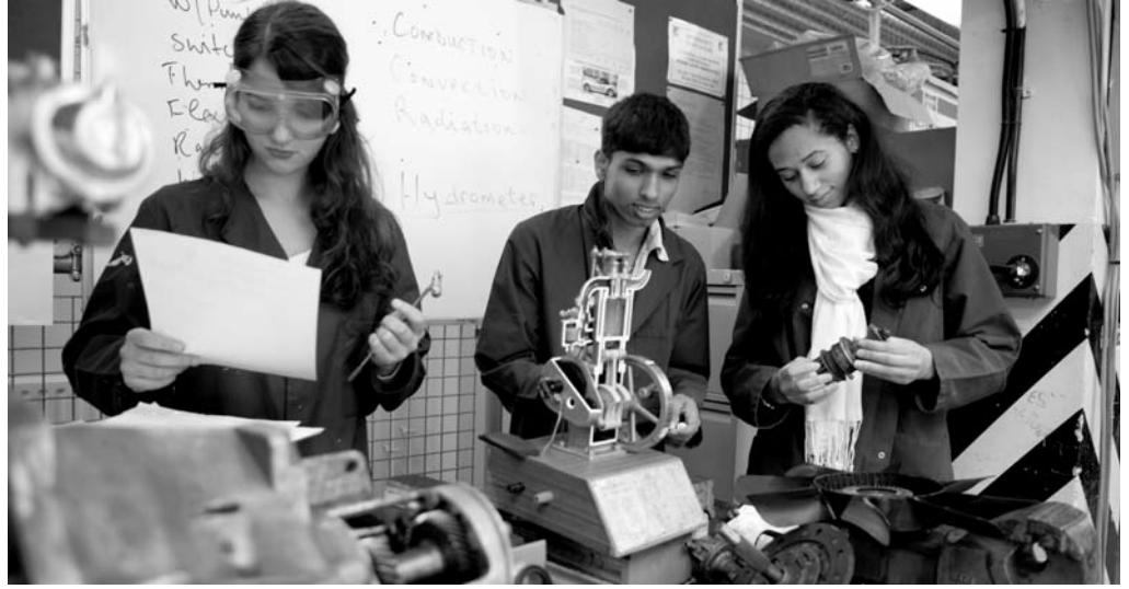
Across all levels of education, we need to do more to sell engineering careers to girls and women

sideline D&T by excluding it from the English Baccalaureate and through future changes to the National Curriculum would be a huge mistake. Moreover, it would put the UK out of step with international trends. The UK's introduction of D&T as a separate subject has been copied in leading economies across the world, including parts of the USA, Australia, New Zealand, Finland, Sweden, the Netherlands, Taiwan, Germany and South Africa.