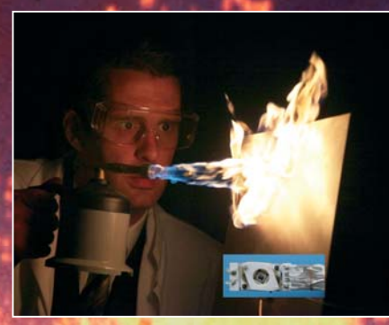
Fig 2 - Silicon carbide electronics under a flame test in the Newcastle Laboratory (the insert at the bottom shows the construction of the sensor and associated electronics).

Within the Extreme team at Newcastle University and supported by the Engineering and Physical Sciences Research Council (EPSRC), we have demonstrated the key components of a system to monitor the concentration of gas in a volcanic fumaroles using an exciting new electronic material, an alloy of silicon and carbon – silicon carbide. The chemical and thermal stability of the carbon-silicon bond is greater than that of a silicon-silicon bond and this results