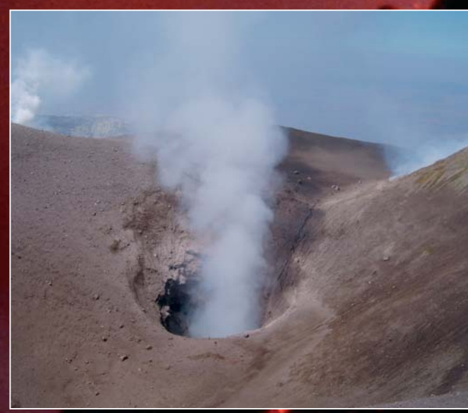
Fig 1 - a gas mixture of steam and acidic gases (typcially CO_2 , SO_2 , H_2S , H_2O and HF) venting from Mt Etna.

Currently, the gas is evaluated using optical means, which requires equipment to be installed at the volcano site, or through the use of remote earth sensing. These techniques measure the content of the plume whilst in the sky, the readings are therefore diluted by the air and so highly sensitive equipment is required. Of course, once a volcano shows signs of activity, people are evacuated to a safe distance, limiting the possibility of further scientific study. There is therefore a requirement for a system which can be installed in the volcano and relay information relating to the concentration of key gas species to a remote location. The primary challenge is the conditions inside the volcano where the emitted gas is typically around 400°C and contains a high concentration of corrosive acids. These conditions are so extreme, that conventional silicon based electronics cannot function.