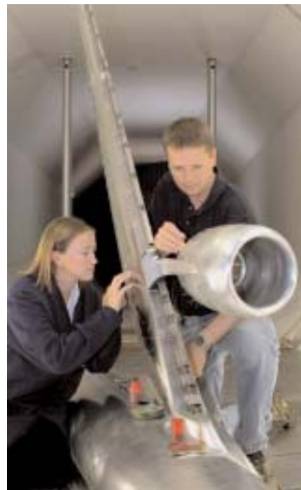
A350 Wind Tunnel Testing at Filton

The new wing is being investigated using extensive aerodynamic testing in a wind tunnel. This includes shaping the wing surfaces to optimise aerodynamic performance resulting in fuel-saving, which together with close-coupled GENx engines and a wing droop nose device, similar to that used on the A380, will enhance performance