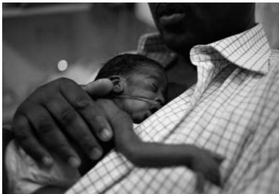
Kangaroo care of premature baby – People – highly commended Kangaroo care is a technique used to help premature babies. The baby is held so that it touches the skin on its parent's chest. This is thought to allow breathing and heart rhythms to be picked up, aiding their regulation in the infant.

Every year, Novartis organises a reception within the House of Commons, giving Members of Parliament a chance to see the images. Details of the reception will follow shortly.