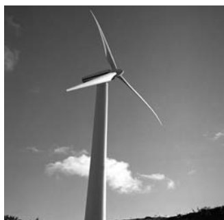
Most wind turbines require considerable quantities of critical metals (principally rare earth elements) in their manufacture.

Delivery of other environmental technologies, and particularly those needed to move toward a low carbon economy will require critical metals in some quantities. Major consumers are likely to be renewable energies, such as wind and solar photovoltaics, as well as low-carbon transport modes powered by electricity or fuel cells.