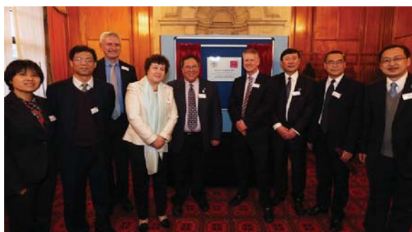
The official launch of the Cardiff University - Capital Medical University Joint Centre for Biomedical Research

on to establish the Cardiff University-Capital Medical University Joint Centre for Biomedical Research. Cardiff