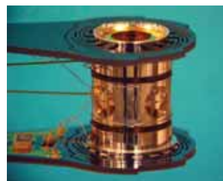
The small gold cylinder, just 8.4mm long, which holds the fuel capsule

Fusion is an important goal for humanity, and one in which the UK's scientists and engineers could play a large role. In the process of achieving ambitious goals where the nature of research makes outcomes and time scales uncertain, it is important to ask two questions. Is progress being made? And is the goal worth achieving? In the case of fusion energy, the