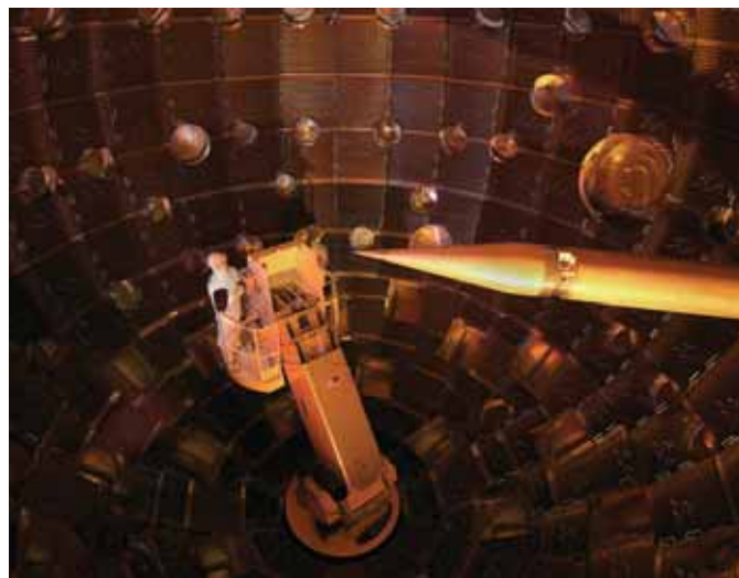
Scientists working inside the National Ignition Facility's target chamber. The fuel capsule, which is just millimetres in size but capable of releasing the equivalent energy of around 50kg of TNT, sits at the end of the long arm.

Laser fusion published its most successful result in 30 years of research in January 2014, in which the energy released by fusion reactions exceeded that put into the last stage of the