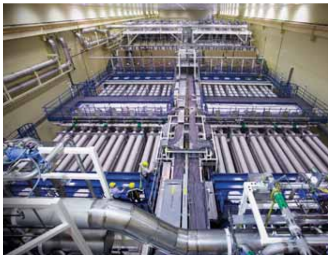
One of the two huge laser bays.

Climate change is certainly happening, and its effects are causing suffering now. The World Health Organisation estimates